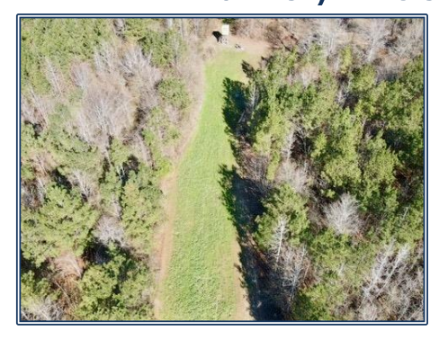
Midway Road, Wesson, MS

This 336 acre tract of land, located in Copiah County, MS, is easily accessible from Highway 28 and is only 45 minutes from Jackson, MS. This property boasts of great deer and turkey hunting. There are multiple food plots, shooting lanes, a creek and a great internal road system for easy access to the entire property. Aside from hunting, this property will also make a great timber investment. Call today to schedule a showing!