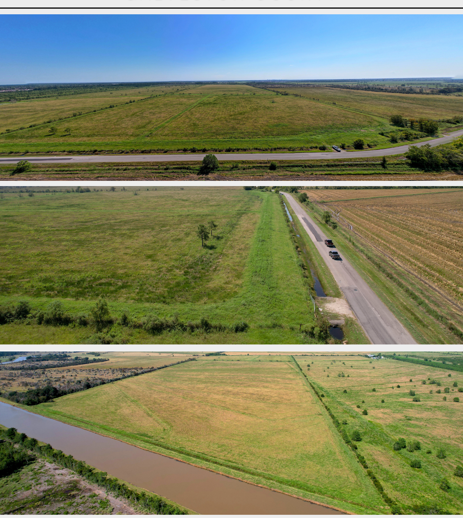
All information is deemed reliable, but is not warranted by MOCK RANCHES GROUP. All information is subject to change without prior notice.