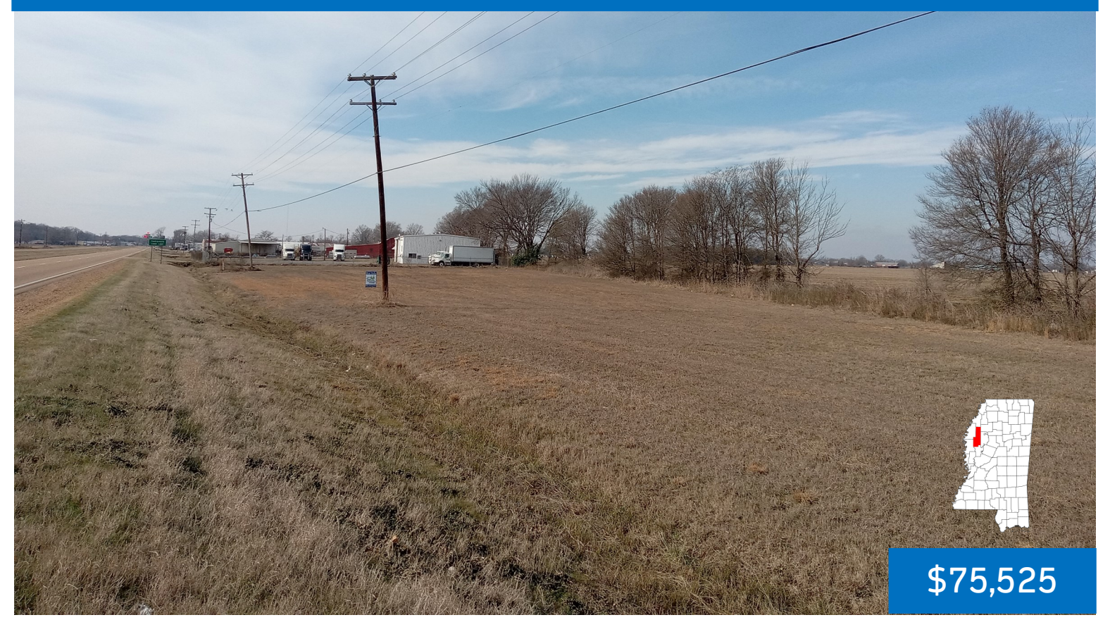
1534 Hwy. 82 Indianola, MS 38751

This 1.5+/- acre tract is conveniently located just off Highway 82 East in Indianola, Sunflower County, MS. A perfect spot for your business with plenty of highway frontage. This highway has over 20,000 daily traffic count. Visibility is key to maximizing this valuable tract for multiple uses, all located just off the heartline of the Delta, Highway 82. Call Emerson for your private showing today.