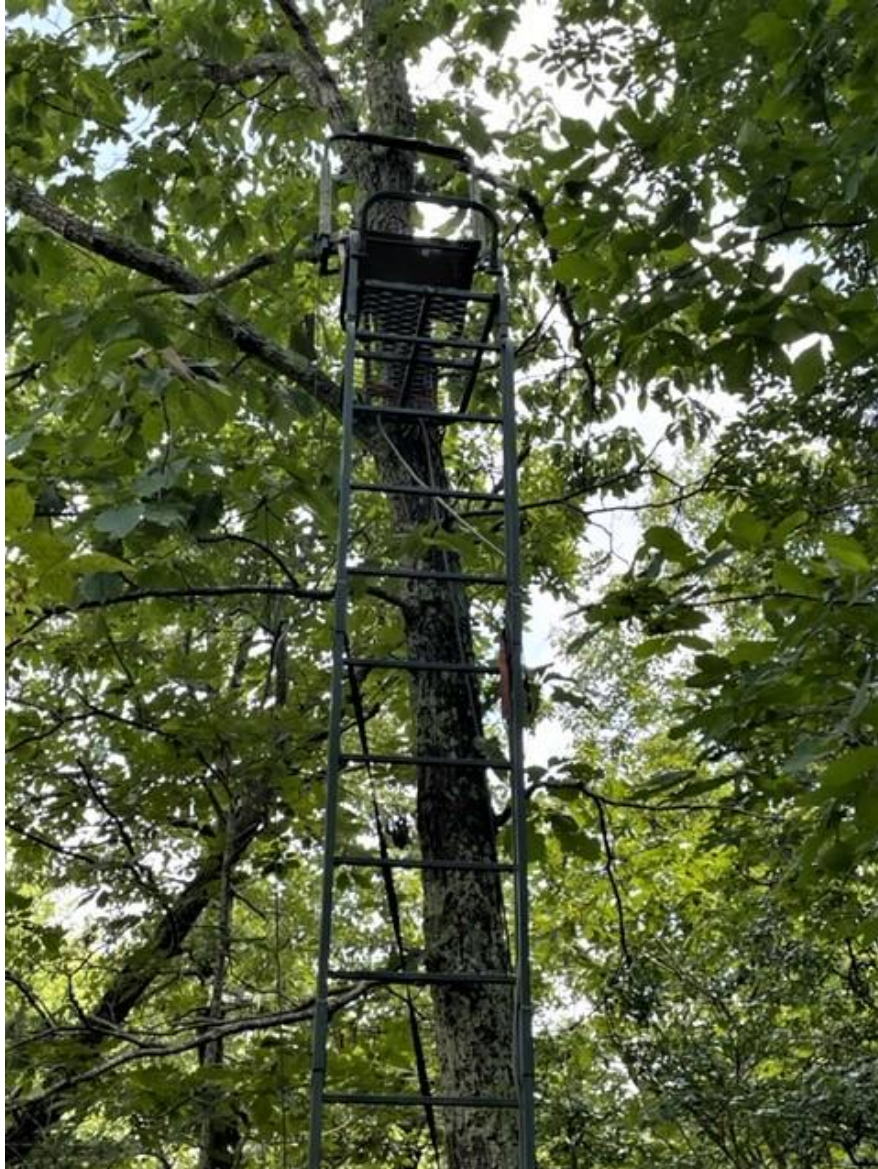
Typical Millennium Brand 21' Ladder Stands