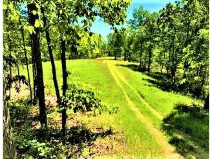
First-time planted food plot. This is the same food plot on previous page at bottom right. The picture on the previous page is after the plot had been planted a few times.