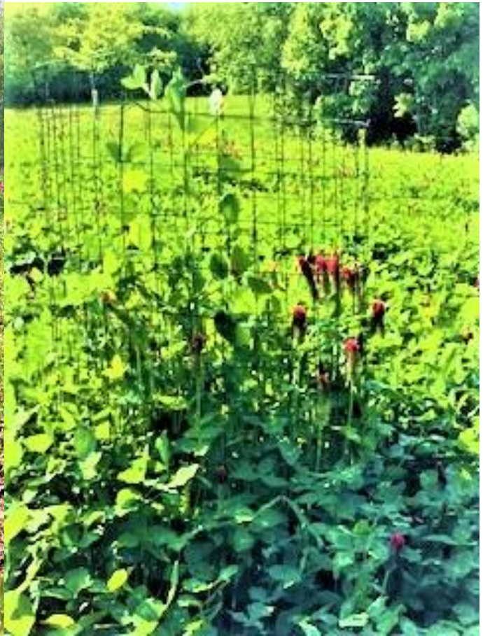
Same cage after Spring Greenup – Will die back in late May to early June. Summer annuals are planted between the Middle of May and Memorial Day.