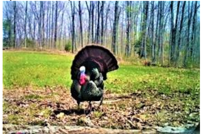
Clover Fields Attract Turkeys and make for Good Hunting

There are other nice features allowed by Tennessee hunting regulations for landowners hunting on their own property. Landowners do not need hunting licenses nor do they need to wear hunter orange or pink. There are certain relatives that are included and you do not need to live on the land for this advantage.