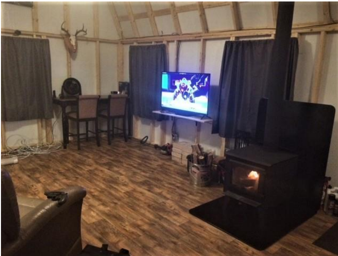
Group Area on Main Level of Cabin