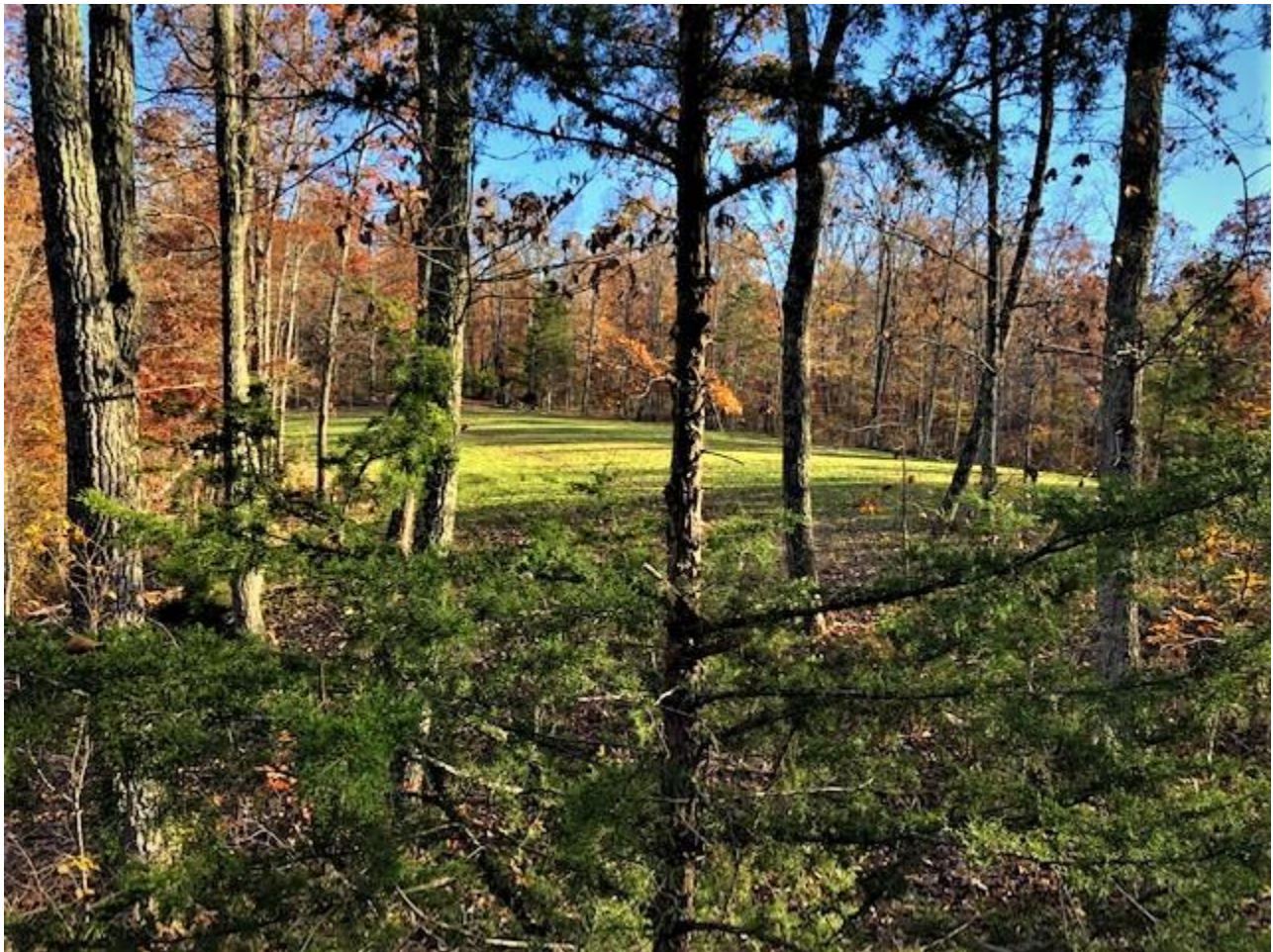
Fall is a Great Time to be Outdoors

Patrey Branch is a turn-key hunting property. There are always new improvements that owners want but these improvements will not be time sensitive so the new owner can begin to enjoy the property while taking their time to make improvements. It is difficult to find properties like this with substantial acreage and ready to go condition.