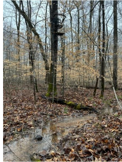
Deer Stand on Spring Creek in Big Draw

After the major flooding of 2010, many of the Middle Tennessee small spring creeks had deposits of cherty rock deposited in them. These deposits are several feet deep in many locations. This has caused many of the streams to go underground and then reappear again later downstream. This phenomenon has probably occurred on this property. This leaves standing water in some locations when rainfall has been low in the area. A nice spring creek comes out of a big draw below some food plots.