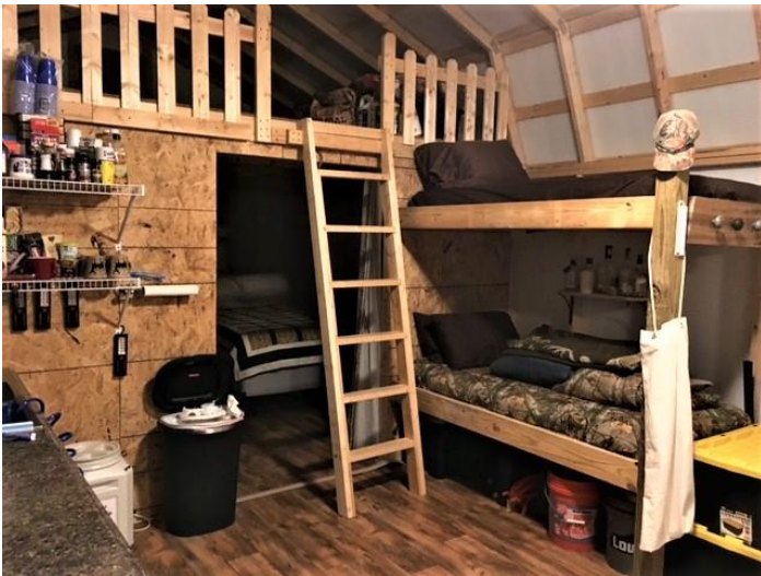
Bunk Bed in Main Area - Queen Bed in Background