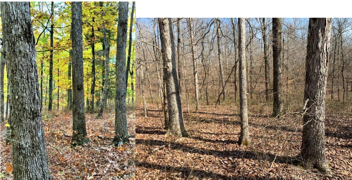
Area of Valuable Oaks (Monetary & Wildlife)