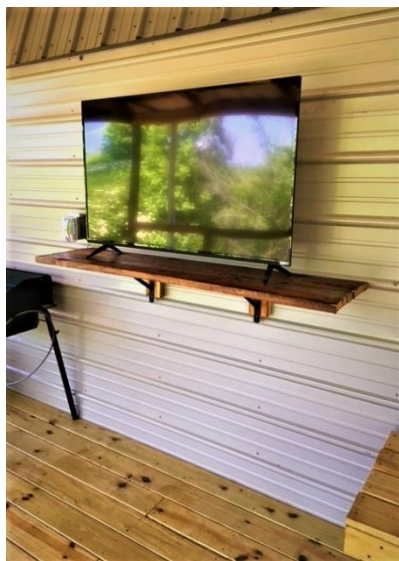
Both TV's have great reception