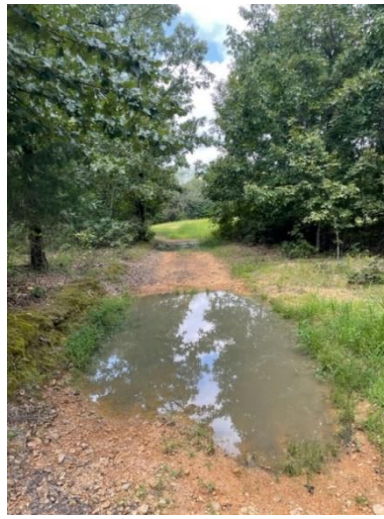
Amazing Perennial Puddle