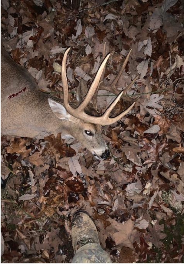
10 Point Buck on the Ground

Deer and turkey hunting is very good on this property. Several mature bucks will be on the property during at least part of the hunting season. The development of a hunting strategy and implementation of the same can maximize the harvest of mature deer. The population base is strong enough to allow youth or first-time shooters to harvest younger bucks. The turkey population has increased as the habitat work has been completed. Several turkeys have been taken each year for the last few years.