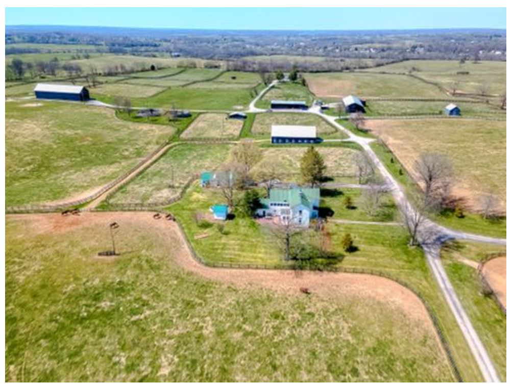
744± Acres OFFERED AT $12,950,000