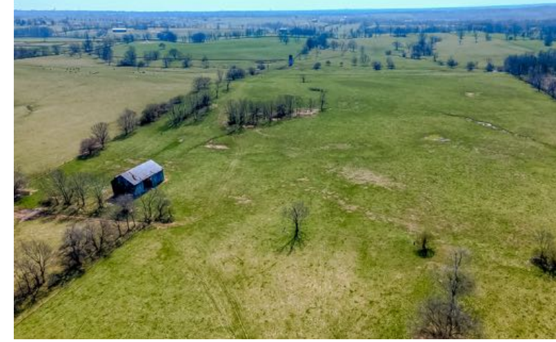
18 paddocks and 12 large fields, 80'x200' sand outdoor riding arena and beautiful views from every direction