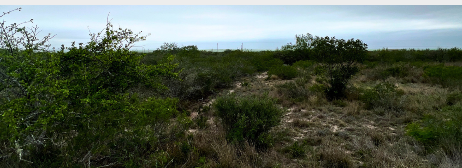
All information is deemed reliable, but is not warranted by MOCK RANCHES GROUP. All information is subject to change without prior notice.