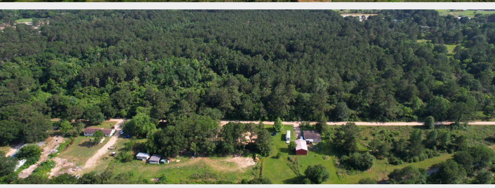
All information is deemed reliable, but is not warranted by MOCK RANCHES GROUP. All information is subject to change without prior notice.