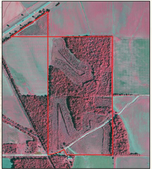
Google Map Link