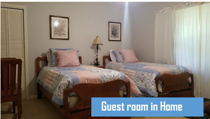
Guest room in Home