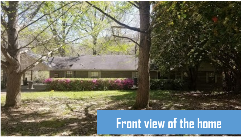
Front view of the home