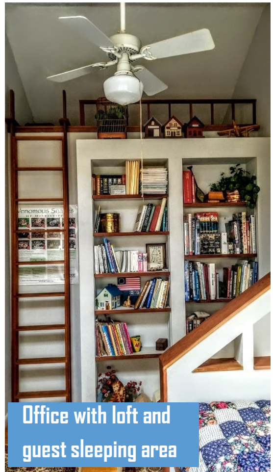
Office with loft and guest sleeping area