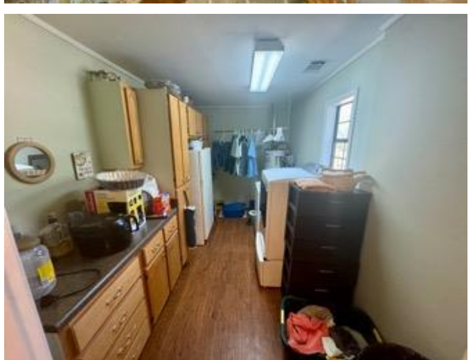
A Real Estate Expert You Can Trust!