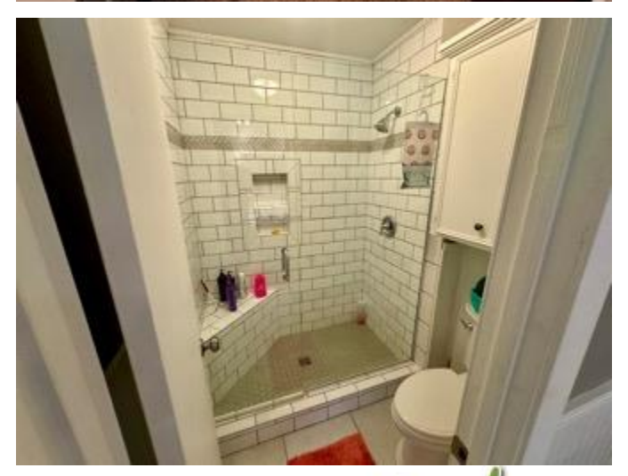
A Real Estate Expert You Can Trust!