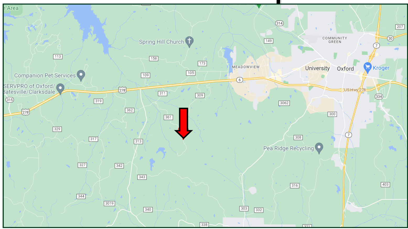
From Hwy 6 and Jackson Avenue in Oxford, MS: Travel Hwy 6 West for 2.7 miles. Turn left onto CR 309. After 2.7 miles, the property will be on your left. GOOGLE MAP LINK