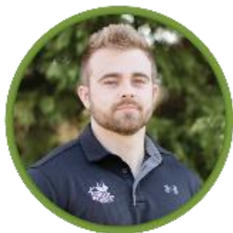
WALKER TRANUM REALTOR®

Directions from the intersection of Hwy 278 and Hwy 25 South in Amory, MS: Travel south on Hwy 25 for 4 miles. Turn left onto Greenbriar Rd. and travel 0.5 miles. Turn left onto Old Hwy 25 S and travel 0.6 miles. Turn left onto Richardson Road. After 0.4 miles, the property will be on your right. Google Map Link