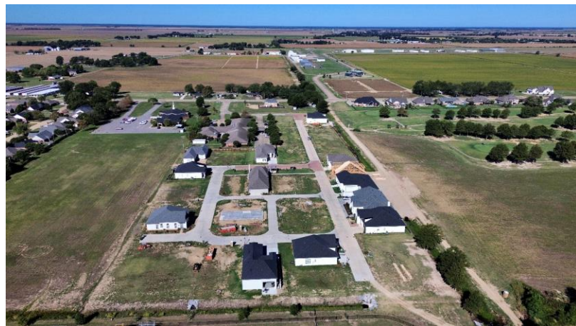
A Real Estate Expert You Can Trust!