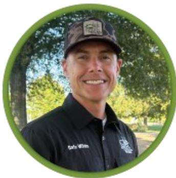
DALE WILDS REALTOR®

This is a rare opportunity to build your dream home or family retreat on one of nine spacious lots in Scott County, MS, each averaging 10 acres. These individual lots are being sold separately, allowing you to create your private estate. The property has been recently cleared, providing a clean slate to bring your vision to life. The lots are perfect for a custom home or vacation getaway with water and electricity on the road. Enjoy the peaceful, rural setting with plenty of open space while still having convenient access to nearby amenities. Don't miss your chance to own one of these beautiful lots in Scott County! Contact Dale or David to schedule your tour today!