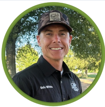
DALE WILDS REALTOR®

This 1.06± acre lot in Rankin County is located at 116 Marsman Rd, Brandon, MS, and offers excellent potential! The property features a spacious 1,500-square-foot drive-through workshop, ideal for various uses such as projects, storage, or working on vehicles. With drive-through access, it's designed for convenience and functionality. Marsman Road is just off Highway 471, making this property an ideal location in the heart of Rankin County. It also provides easy access to Downtown Brandon and the numerous attractions and amenities off Lakeland Drive. A single-wide mobile home (of no value) sits on the east side of the property, leaving you with a blank slate to create your vision in the Northwest Rankin School District. Schedule your tour today to explore the possibilities of this Rankin County gem! Don't wait—contact Dale or David to see it for yourself!