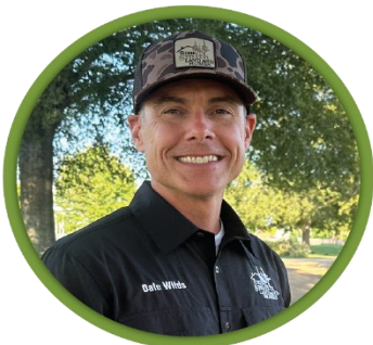
DALE WILDS REALTOR®

This 3-bedroom, 2-bath home in Yazoo City sits on over an acre of land and is packed with potential! In addition to the main living areas, this property includes a bonus room for added flexibility and a dedicated, separate office—perfect for working from home, managing a business, or creating a private study space. The spacious yard offers plenty of room for outdoor living, gardening, or future expansion. Plus, the workshop provides valuable space for tools, storage, or hobbies. Being sold as-is, this home is a prime investment opportunity or a great choice for a family looking to personalize a house with solid structure and great bones. With a little vision and creativity, this property can be transformed into something truly special. Don't miss your chance to make this Yazoo City gem your next project or forever home!