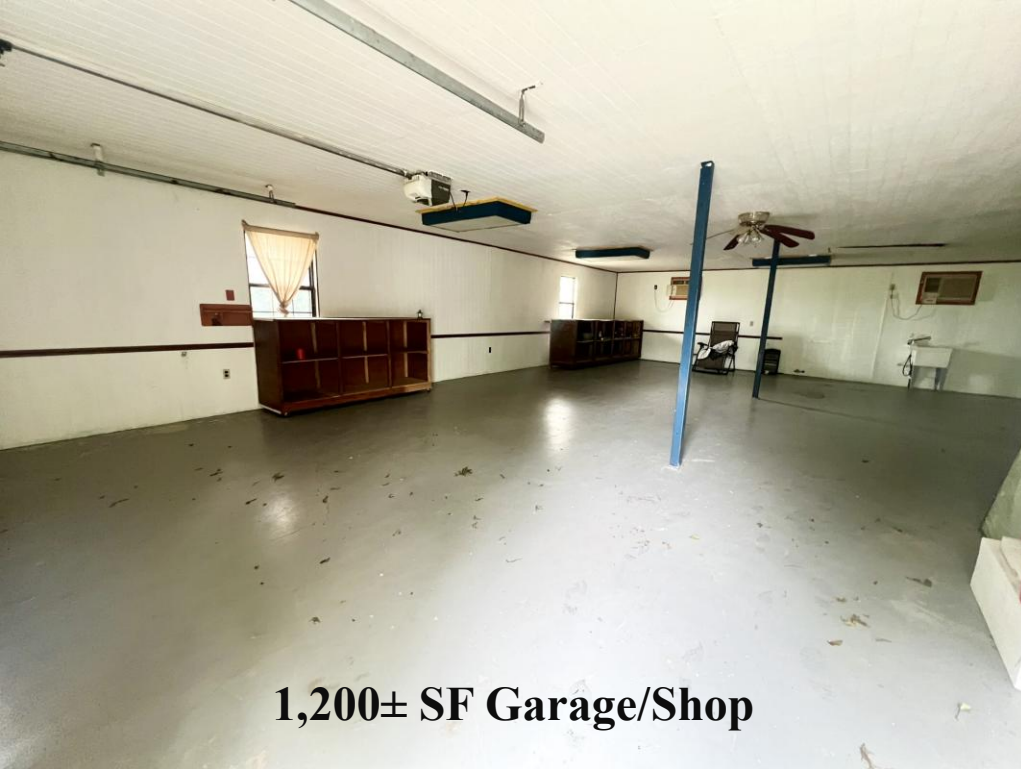
1,200± SF Garage/Shop