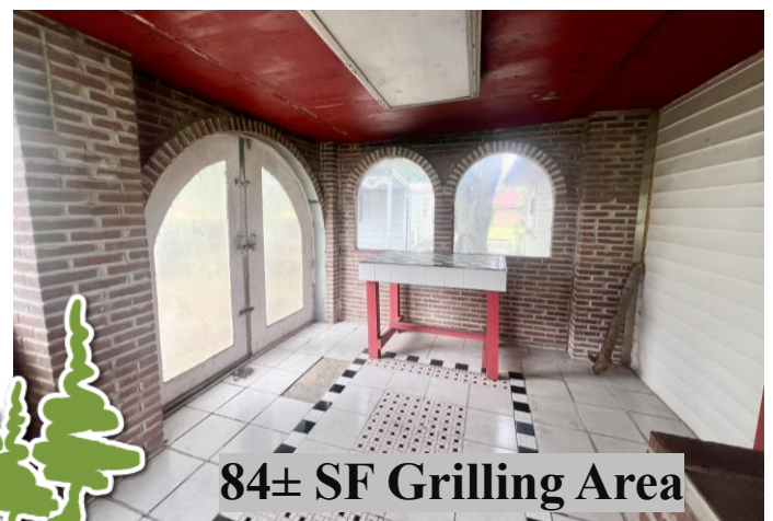
84± SF Grilling Area