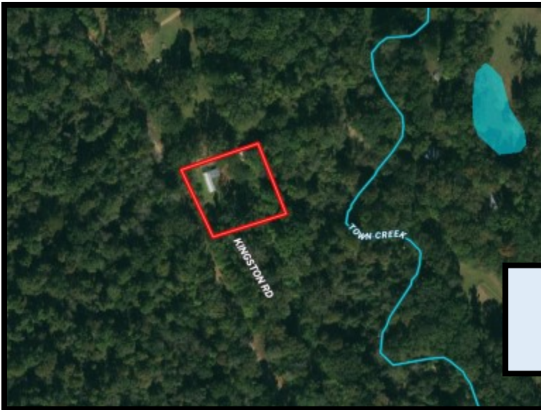
FEMA Flood Map