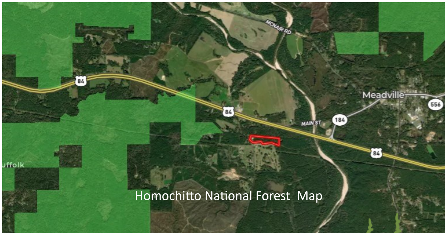
Homochitto National Forest Map