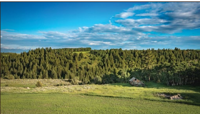
With 2.5± miles of trophy trout water flowing through the ranch, diverse topography and landscapes, big game and upland bird hunting opportunities, the Badger Creek Canyon Ranch represents a blank canvas with an array of recreational attributes along with a small farming component in a highly desirable location.

This information is subject to errors, omissions, prior sale, change, withdrawal and approval of purchase by owner. All information from sources deemed reliable but it is not guaranteed by Hall and Hall. A partner at Hall and Hall is the agent of the Seller. A full disclosure of our agency relationships is included in the property brochure available at www.hallandhall.com or by contacting the Listing Broker.