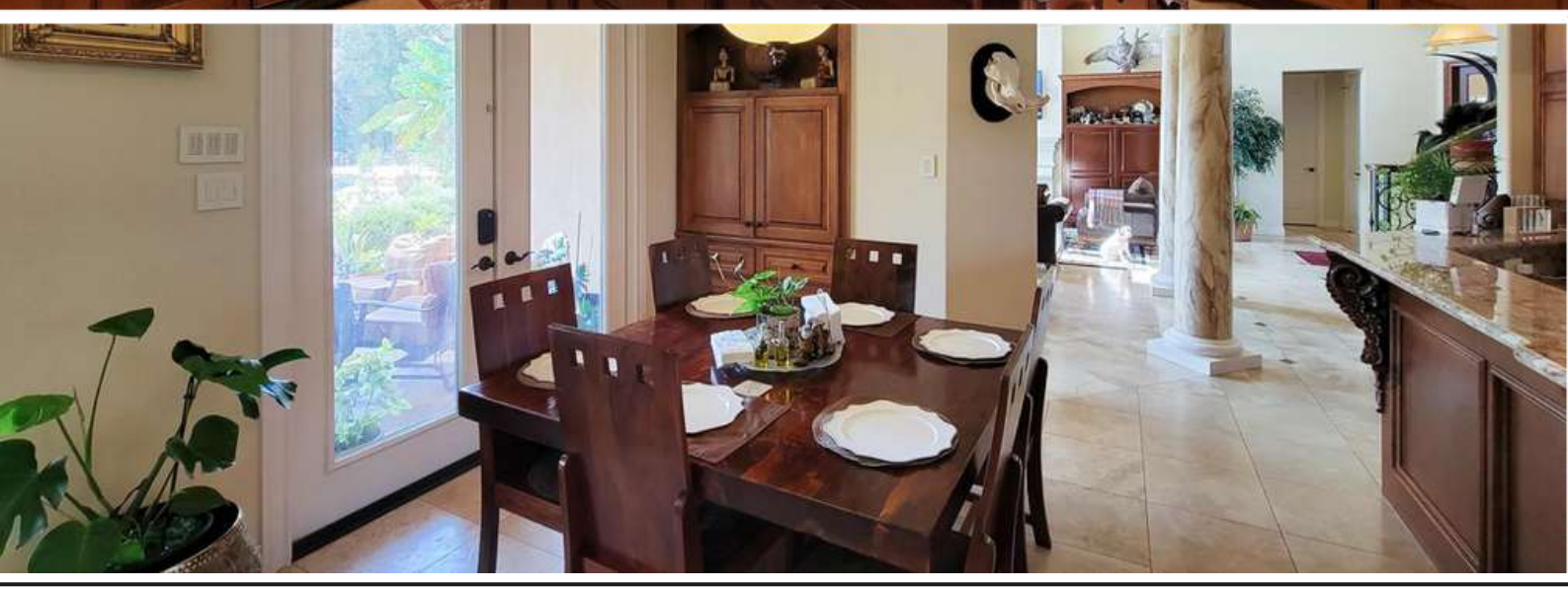
All information is deemed reliable, but is not warranted by MOCK RANCHES GROUP. All information is subject to change without prior notice.